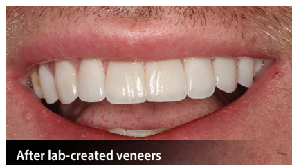
After lab-created veneers