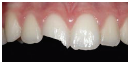
Chairside same day veneers, before and after