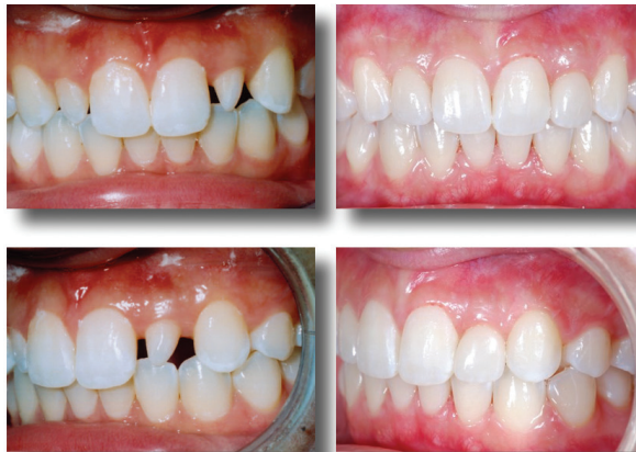
Veneers by Innovative Dentistry